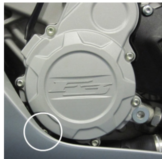
GBRacing Bolt 3